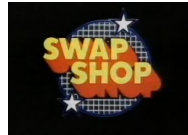
Swap Shop logo from the original 1970s TV series

Created by member groups of the Adult Learning Group: GCVS and Glasgow Life.